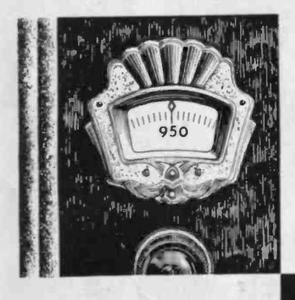
A Key Station of the Columbia Broadcasting System, originating regular daily programs to stations west of the basic network.

FOODTOWN KITCHENS, Inc., Chicago, makers of Pops, a breakfast food, will sponsor the Pops Pirate Club, a juvenile feature, six nights each week over WGN, Chicago, beginning May 9. McJunkin Advertising Company, Chicago. is directing the Pops advertising. The Pirate Club is a feature originated by A. T. Sears & Son, who will assist in the production.