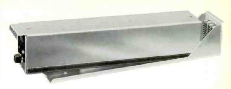
Above illustrates preamplifier and tray assembly. Plugs on all amplifiers are recessed to assure no damage to pins.

Complete mounting accessories are available for the 6300 Series Solid-Statesman Amplifiers. The M-6345 Panel and Shelf Assembly unit occupies only 3\frac{1}{2} " of 19" wide rack space. Built of heavy gauge plated, noncorrosive steel, finished in medium satin gray, and with hinged front panel. The shelf assembly is provided with an upper cross-bar to prevent damaging amplifier plugs or tray receptacles. Individual mounting trays have been designed for each model of amplifier and power supply.