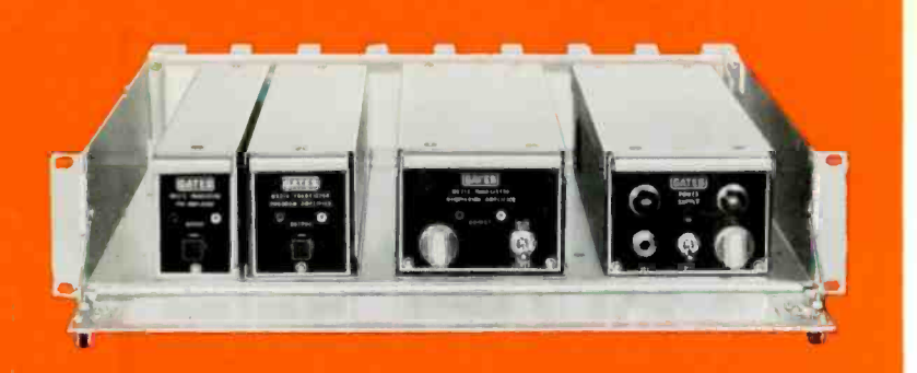
Above M-6345 Panel and Shelf Assembly showing for illustrative purposes one each of preamplifier, program amplifier, monitoring amplifier and power supply. Only 3\frac{1}{2} " of rack panel space is required.