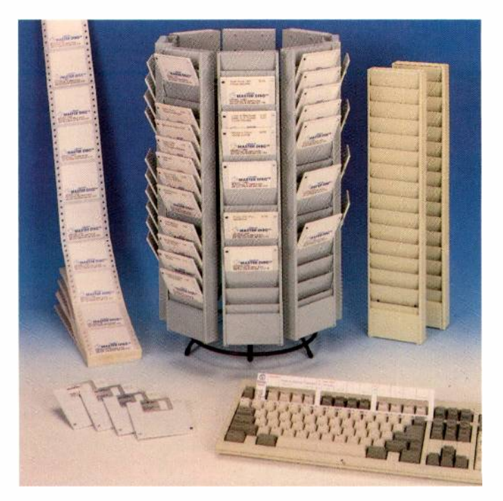
DCR1000 Media and Accessories

Fidelipac offers all of the tools needed to simplify usage of the DCR1000 Series. Accessories include wall mount and carousel style disk storage racks, label printer, disk labels, and pre-formatted floppy disks. A PC/AT keyboard with command template is included with each Record Module.