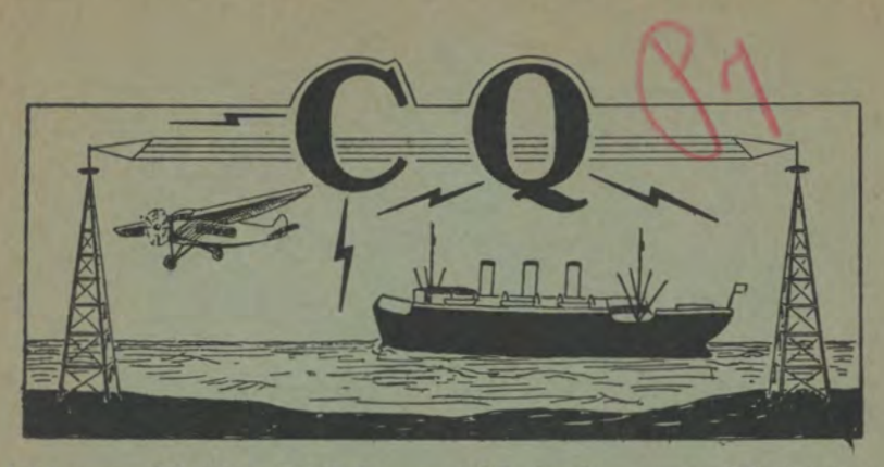
A Magazine OF, BY and FOR Commercial Radio Operators and Technicians