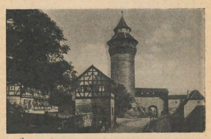
Nuerenberg Castle, Nuerenberg, Germany

WHERE TO STOP HOTEL RATES ACCOMMODATIONS AVAILABLE