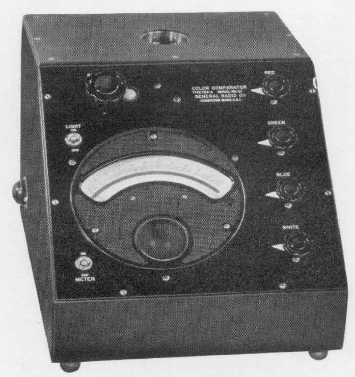
FIGURE 1. TYPE 725-A Color Comparator. Color intensity is indicated as a meter reading. Filters are shifted by means of the knob at the upper left. The pilot lamp indicates which filter is in position

Color matching in most industrial plants still depends upon the skill and the color judgment of an experienced operative unassisted by instrumentation. This method of matching is open to rather serious objections. In cases of disagreement there is no impartial