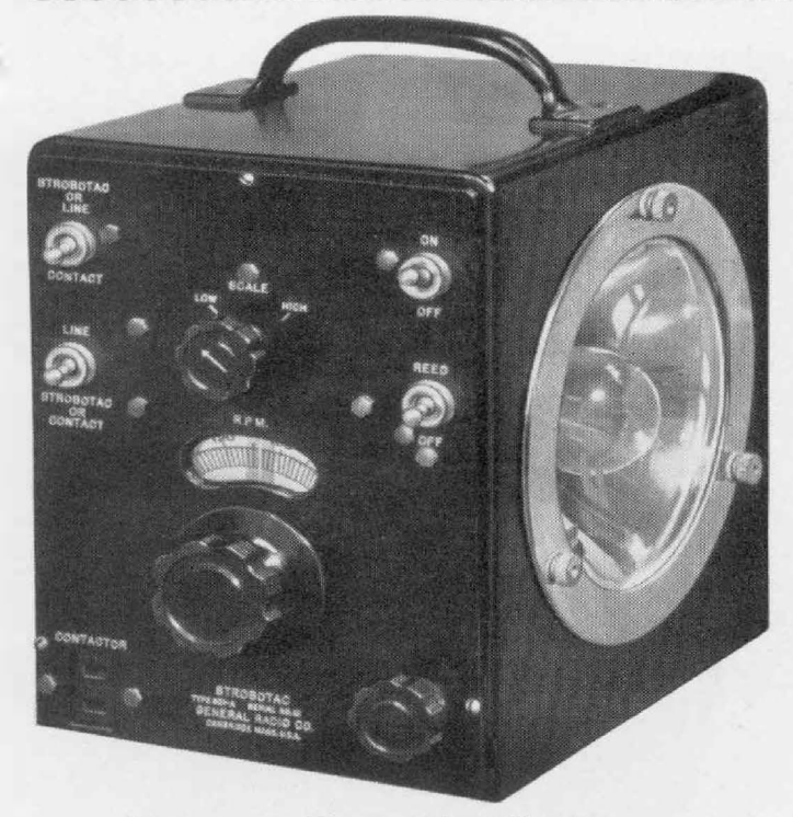
FIGURE 2. TYPE 631-A Strobotac

The strobotac may also be used to obtain highly accurate measurements of the slip of induction motors. For this purpose, the strobotac is controlled by the power-line frequency and the slip of the motor may be counted directly. A similar method can be used to observe hunting and transients in synchronous motors.