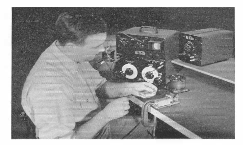
Figure 5. The Comparison Bridge used in adjusting an air-core inductor to 0.1% tolerance at General Radio's West Concord (Mass.) plant.

Frequency: Frequencies of 400 c, 1 kc, and 5 kc are provided, selected by panel switch. The frequency is within \pm 3\% of the nominal value. Grounding: Two ground positions are provided, one of which grounds the junction of the standard and unknown impedances. With this connection, the total impedances between the high terminals and ground are compared. In the other connection, the junction of the ratio arms