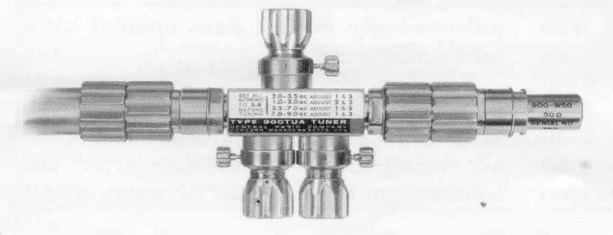
The Type 900-TUA Tuner installed between a coaxial line and a matched termination.

Types 900-WNC and -WNE Short-Circuit Terminations. The former is de-