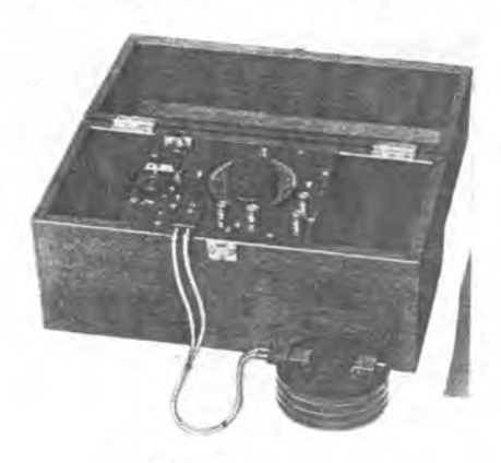
Fig. 2. Early Type of Wavemeter.

The company's development was almost immediately diverted from the normal course by the entrance of the United States into the World War. Plans for the development of an increasingly wide