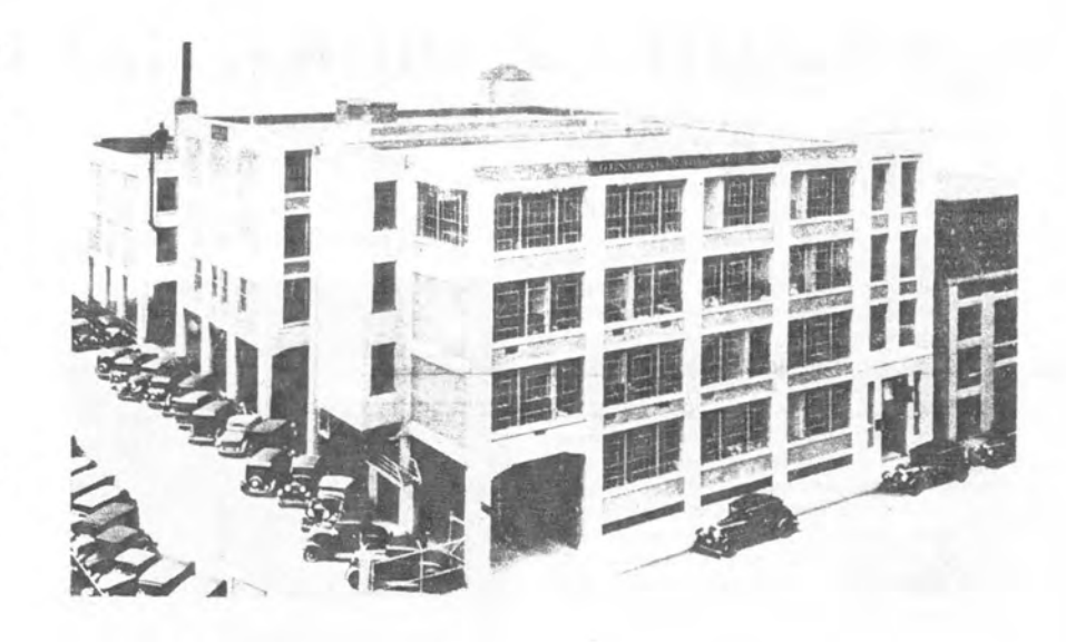
Fig. 5. The Present Plant of the General Radio Company. Of the three units shown the first was completed in 1924, the second in 1925 and the last in 1930.

Reprinted from the November-December, 1935, issue of THE INSTRUMENT MAKER