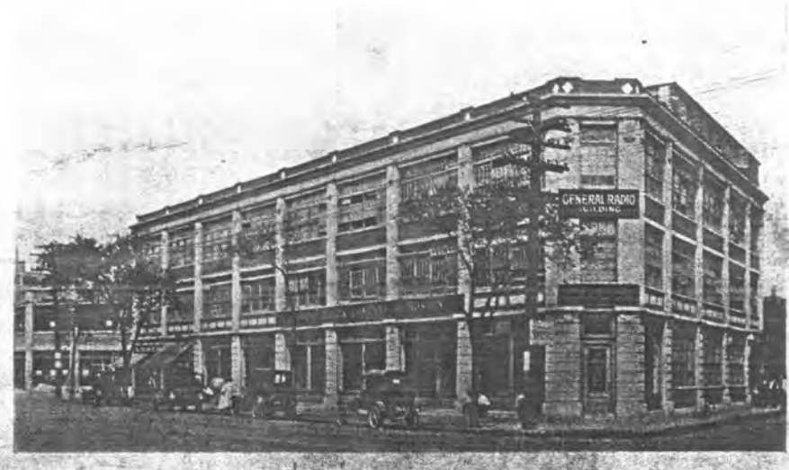
Fig. 4. Windsor Street Factory, occupied about 1917.