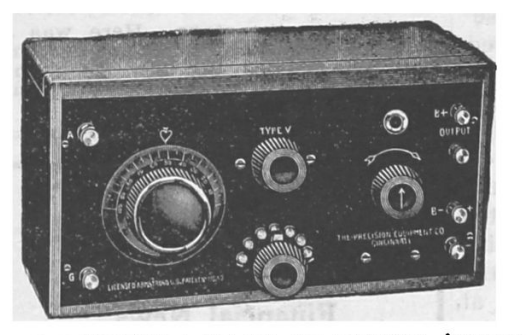
CROSLEY TYPE V NOW $16.00

Type V or 3B may tions. Hung up a little record not bring them in the first time you