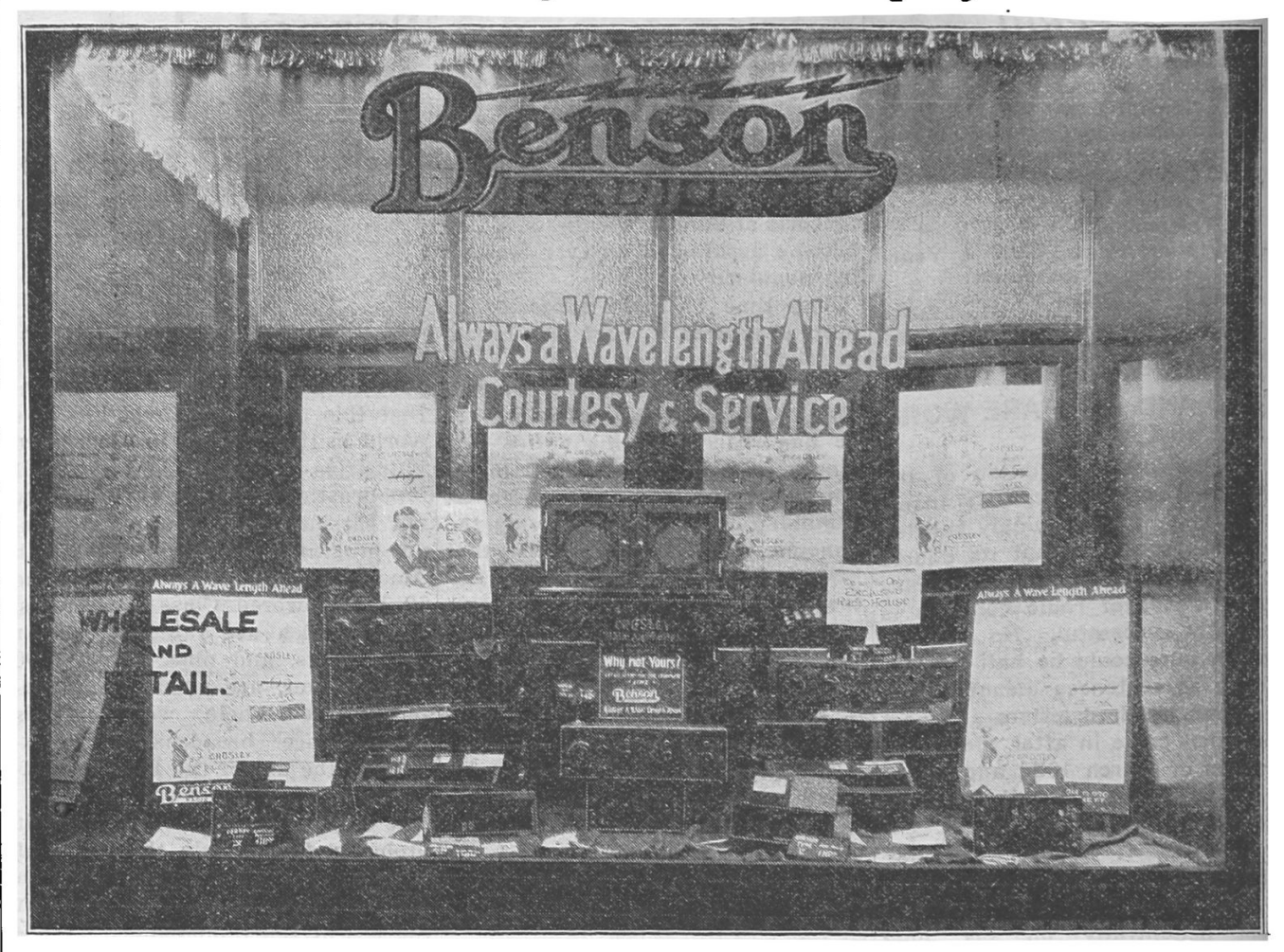
Above is a picture of the window display that won the contest recently conducted by the Crosley Radio Weekly. The display is that of the Benson Radio Company, 926 Pine Street, St. Louis, Mo.

in radio was never better accord- not reasonable to think that this ing to many dealers. Inquiries which have been made by fans take them into the country during programs on an outing.