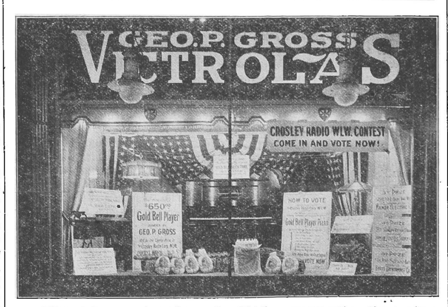
The picture on top shows the kiddies representing the various institutions, interested in the piano contest recently conducted from WLW. They witnessed the counting of the votes. Below is a picture of great window display prepared in connection with the contest.