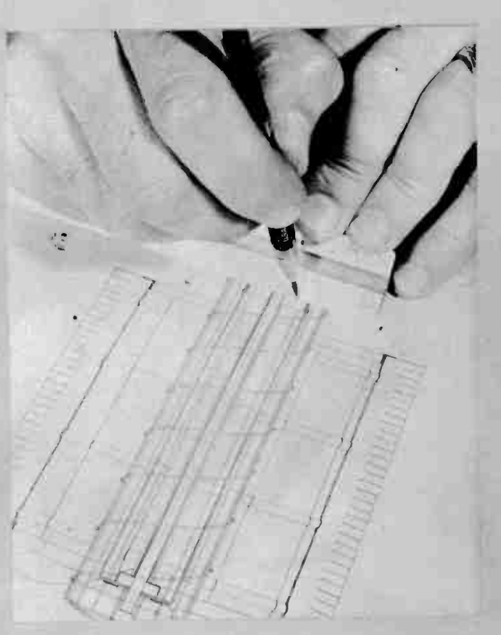
Before anything is done in the way of manufacturing, drawings are made in the Drafting department of the complete detail of the plate and its alignment with the other elements