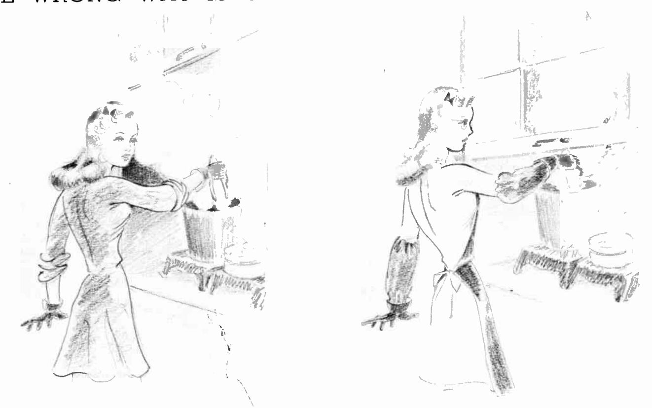
The drawing on the left shows five safety measures being disregarded. How many can you find? Compare the two drawings and see if you can find five. Page nineteen tells all!