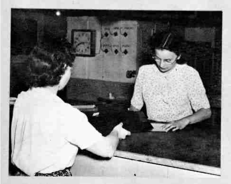
The beginning of the producing. An operator from the Punch Press department gets some tantalum sheets from the Materials Control Stockroom, and the manufacture will soon get underway

The sheets are sheared in precision cutters to the proper size, then each piece is stamped or drawn to shape with a die in a power punch press, thus forming a plate section.