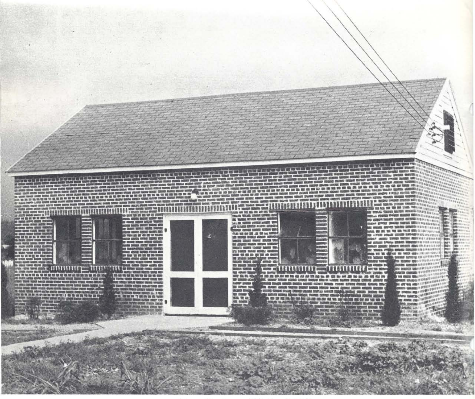
Transmitter House at Station WKAX