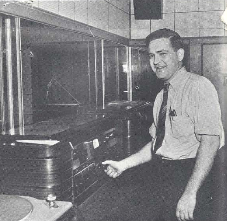
Gates BC-1E Transmitter Studio View Looking Into the Control Room.