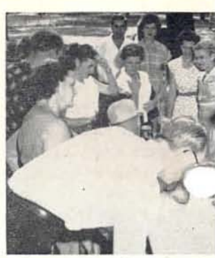
The credit union guessing I don't know-h