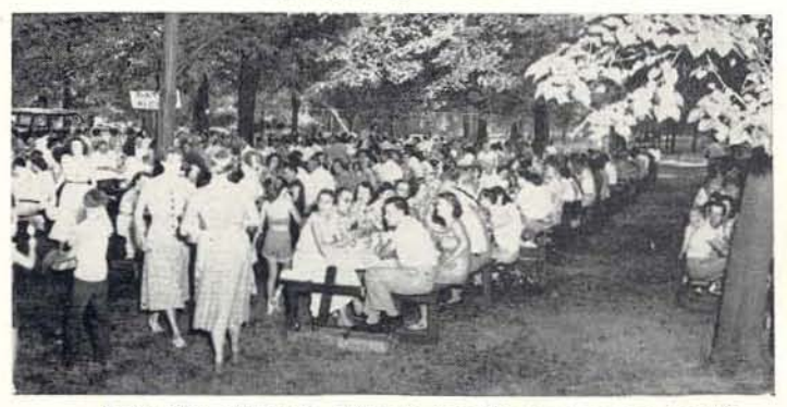
Pass the giblets! Where are the ice cream bars?