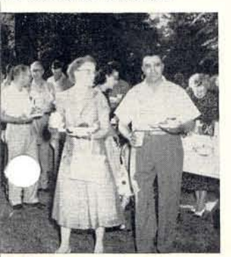
ng for a place to sit.