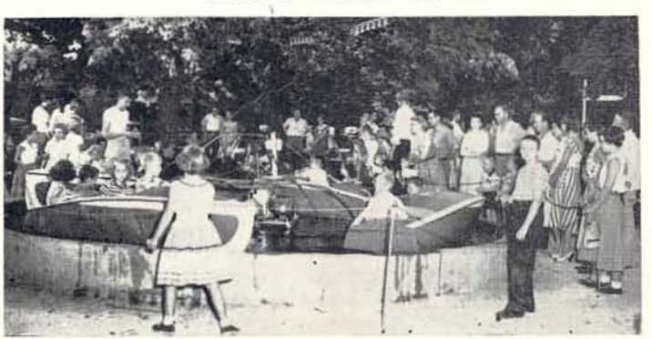
Say! Do you have any more tickets?