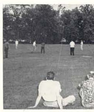
A new kind of ball