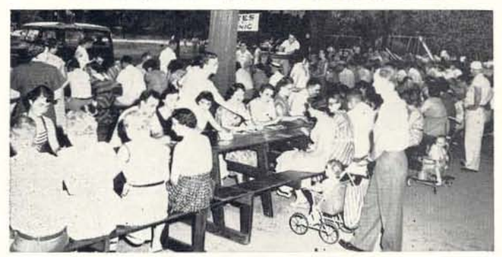
Under B-Number 18!