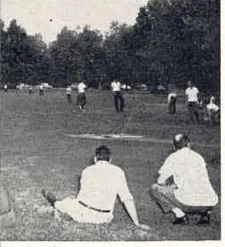
no batter or catcher?