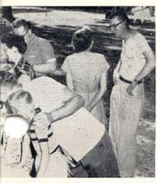
had many of us stumped. ny do you think?