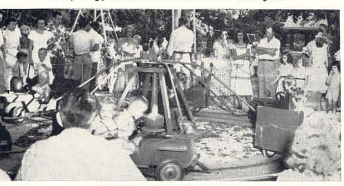
1954 Hot Rods in action!