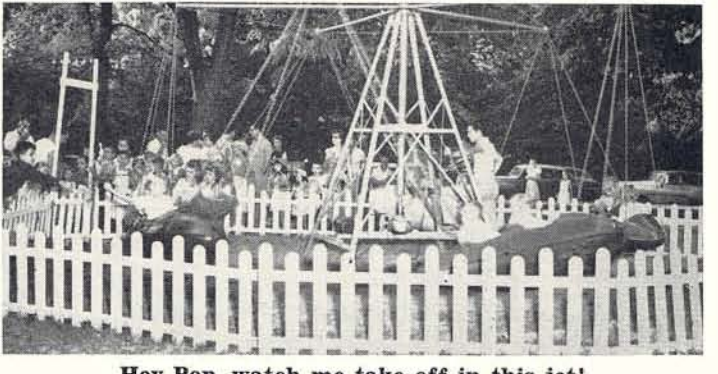
Hey Pop, watch me take off in this jet!