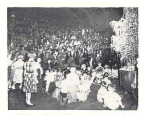
Calling all children—Santa is looking for you!

Because of this being a mighty busy season for Santa, he usually has to cut his visit short, but this year he planned his schedule far enough ahead to spend more time at the Gates party. In fact, he agreed to