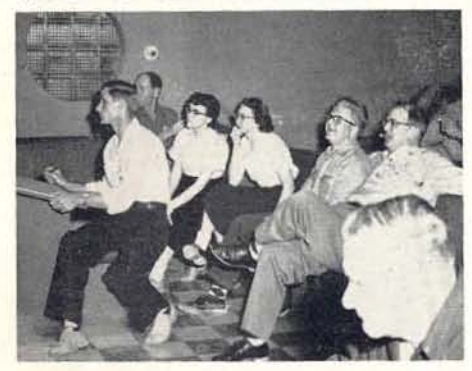
Is it a hit or a miss?

The bowling season has drawn to a close and once again all bowling participants report having a successful season. Naturally it was more successful for some than others.