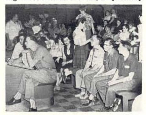
Why so glum folks . . . didn't anyone have a good game?

en dinner to close out their season when they gathered at Turner's Hall on May 9. Of course there are bowling lanes available there, so probably