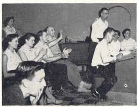
Who got the sloppy hit?

en dinner to close out their season when they gathered at Turner's Hall on May 9. Of course there are bowling lanes available there, so probably