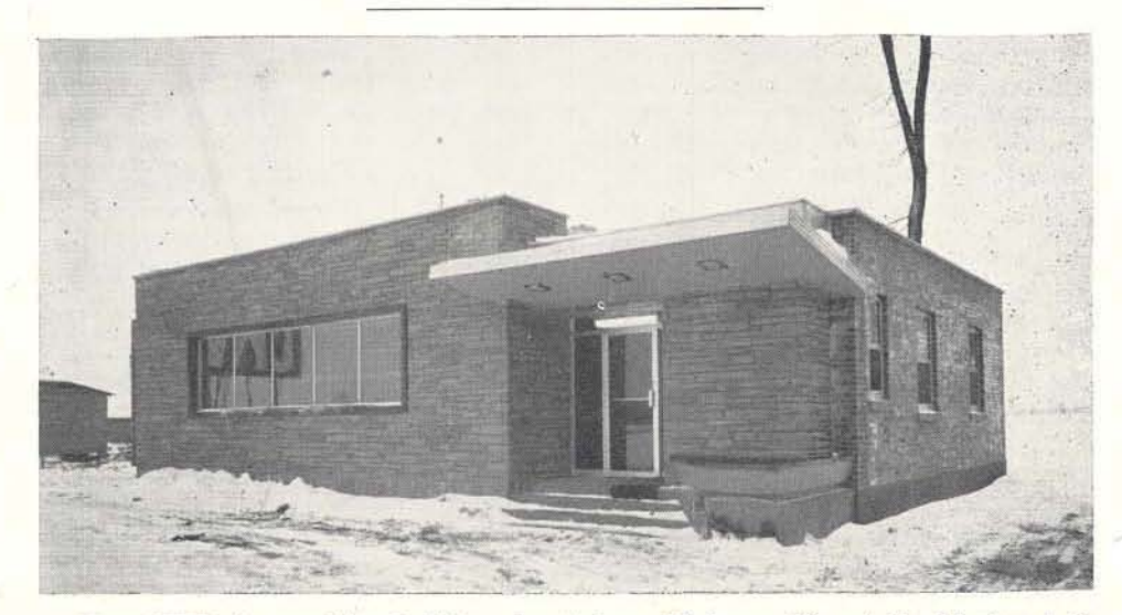
New CKVL transmitter building located on Highway 96 outside Montreal, is shown above. This building contains two Gates BC-10B transmitters and all other equipment required for 24-hour a day operation.

Pictured above are the heavy duty plate transformer, modulation transformer and modulation reactor for the BC-10B transmitter. These transformers are all oil-filled, made by the Moloney Electric Company for Gates, and contain a substantial amount of iron and heavy copperwinding, making them probably the most rugged components supplied with any 10KW broadcast transmitter.