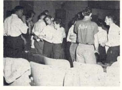
Everybody checking scores, getting ready to move to the next alley.

Many are hanging up their bowling shoes for the summer and are putting their bowling ball in the trunk of the car to roll for the summer season.