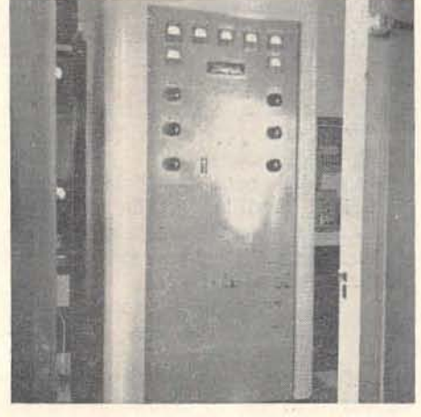
Gates Transmitters are used by many stations in Puerto Rico. WABA in Aquadilla, Puerto Rico has been on the air since 1951, operating 250 walls on 1240 kc. Pictured above is their Gates BC-250GY Transmitter.