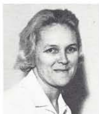
1 year Norma Ancell Cable Assy.