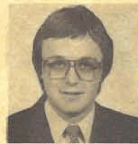
Carl Dentzel Program Administration