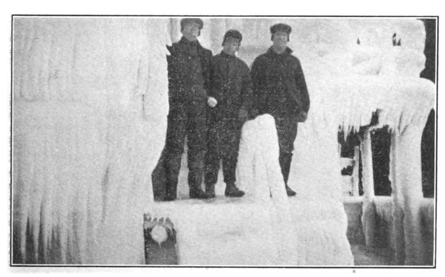
In the Day's Work—Main Deck and Bridge of M & B Car Ferry No. 1 on Ianuary 30th

the aerial tuning inductance to ascertain if a slight addition or subtraction of inductance at that point will not increase the value of antenna current. If the antenna current does not increase (with normal A.C. voltage) it is probable that one or several of the plates in the quenched spark discharger are short-circuited. The condition of the gap can be tested by means of the small spark gap tester furnished with the set. If two plates of the