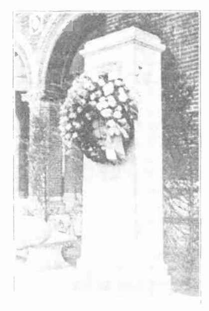
Memorial to operators lost at sea, Battery Park, New York

We'll twine a wreath in the morning hours