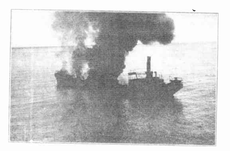
Incineration of the Watts at Genoa

shove. The vessels in the harbor kept up a continuous blast of whistles, the naval station sounded its danger siren, and the bells of the city were ringing violently. Small boats of all descriptions same hurrying out to us and picked up the members of our crew who were swimming around in the water. Some of the men picked up by the life-boats, were almost crazed by the experience. Their faces were distorted with fear and had the expression of men who had lost all conciousness of their true being. My mascot, a little fox terrier pup, seeing the rest jump overboard, took a running leap into the water and was rescued,