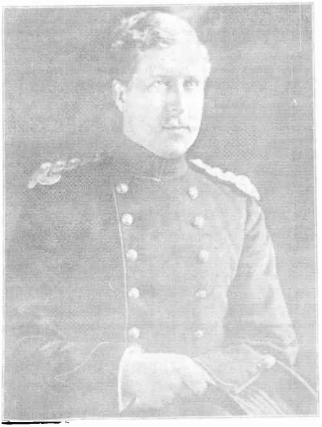
ALBERT Daired by Google King of the Belgians