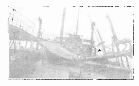
WRECK OF BRIDGE

The ship, being out of control, was swept from stem to stern by the largest and most confused seas ever experienced by anyone on board. Anxiety now began to prevail amongst the officers and the crew, as the ship not being under control and drifting at the mercy of the wind and sea, it was feared she would, by daylight, be somewhere off the Florida reefs, and if this was the case and the wind continued blowing at its present rate, the ship would run ashore and put us in a very serious position. At about four o'clock in the morning, September 10th, which was the most critical moment, the ship struck bottom and came to a complete standstill, giving us all the impression that she had gone ashore. A few minutes later a tremendous sea swept the ships it whole length, smashing in the starboard side of the chart room and wheel house, and carrying away all ventilators, hand rails, searchlights, compasses, etc., and letting tons of water into the quarters below. This monstrous sea acted more like a tidal wave than a sea carried by the wind, and we believe that this same wave was responsible for the foundering of the