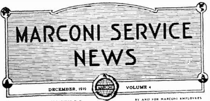
PUBLISHED AT 133 BROADWAY, N. Y.