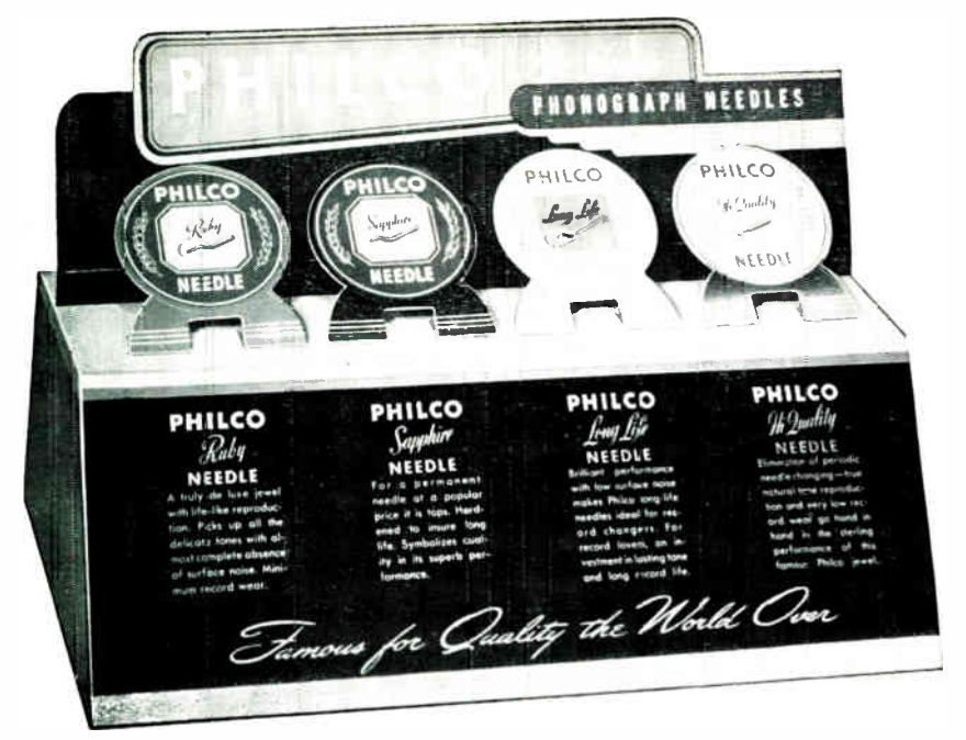
CONVENIENT DRAWER AT REAR OF MERCHANDISER HOLDS 48 NEEDLES!