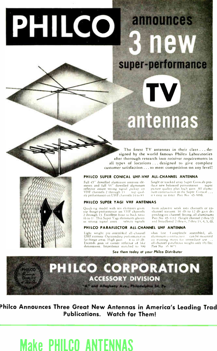
Philco Announces Three Great New Antennas in America's Leading Trade

Quality always shows up and you can always count on world famous Philco quality. All of the above accessories are in stock at your local Philco Distributor and are listed by part number in your Accessory Catalog.