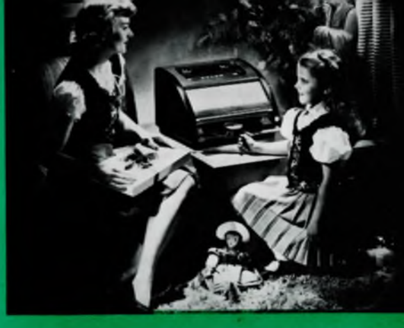
▲ A CHRISTMAS WISH COME TRUE—A new Philco 1201 radio and automatic record player in the home.