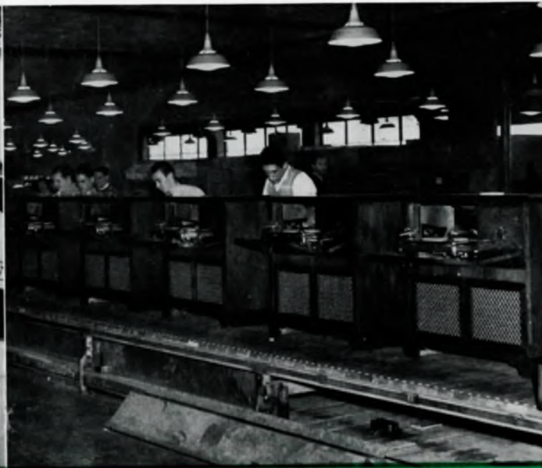
\triangle FINAL ASSEMBLY and checking of the Philos 1213 radio-phonograph in Plant 3.