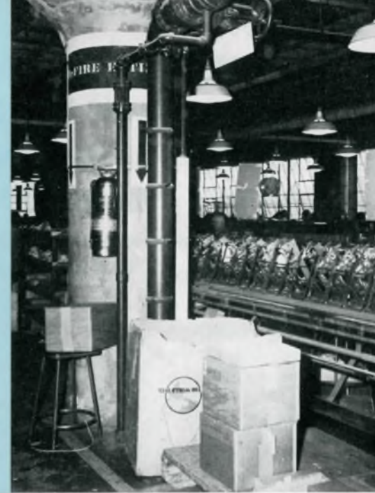
AN EXAMPLE of how good housekeeping pays in the Television Section of Philco.