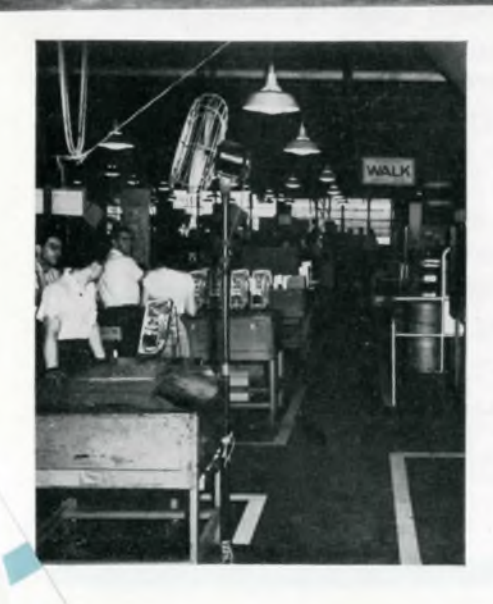
ABOVE—Safe piling of stack provides against accidents and fires. The Plant 3 stockroom is a model of good housekeeping.

Often we think of good housekeeping as meaning a clean floor. There is much more to maintaining a good home than merely removing the surface dirt. The orderliness of stock piles; the arrangement of materials; free and unobstructed aisles; the elimination of rubbish and debris; the clear access to fire equipment, safety equipment and electric controls;