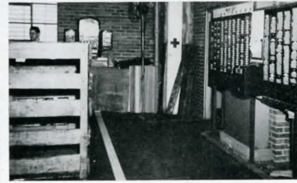
▲ HERE'S some BAD housekeeping—the aisle is clear, but the stretcher box is blocked.