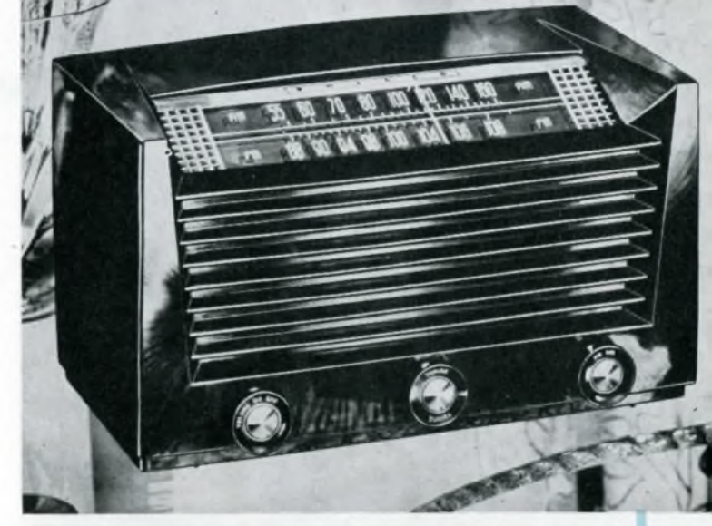
NEW PHILCO FM-AM TABLE RADIO HAS DOUBLED SENSITIVITY OF FM reception, thanks to a new three-gang condenser and three tuned RF (radio frequency) circuits. Rejection of image signals and higher signal-to-noise ratio also result in better FM reception, even in fringe areas. Standard broadcast (AM) reception sensitivity is up 3-to-1. This handsome new Philco Madel 934 FM-AM table receiver is housed in a modern mahogany plastic cabinet, 7% high, 13% wide, 7% deep.

Sponsors for the 1950 Athletics and Phillies games are The Atlantic Refining Company and P. Ballantine & Sons, Inc. The same sponsors will be seen on all three stations. Atlantic Refining is handled by N. W. Ayer & Sons, Inc., while J. Walter Thompson is the agency for Ballantine.