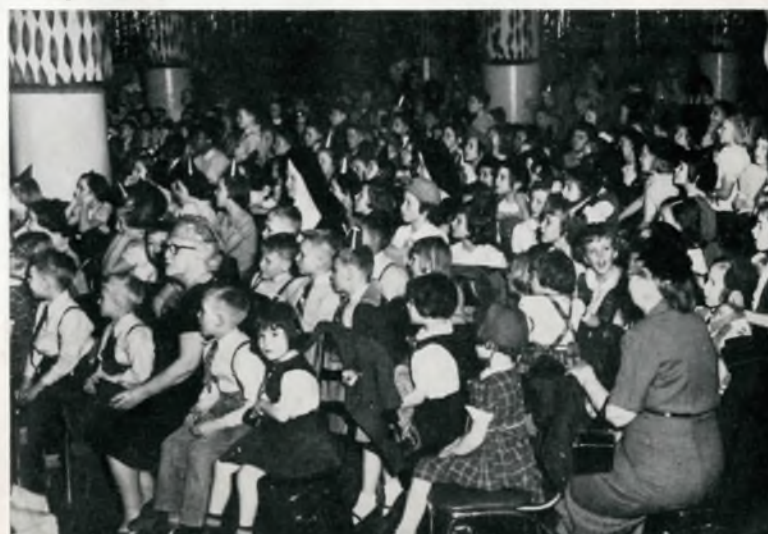
A TENSE MOMENT on the stage is caught by the cameraman seeking to get an over-all view of the enthusiastic audience. \pmb{\nabla}