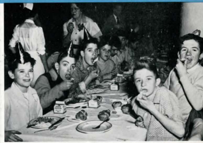
INTEREST in what is going on on the stage momentarily over-comes hearty appetites at the party.