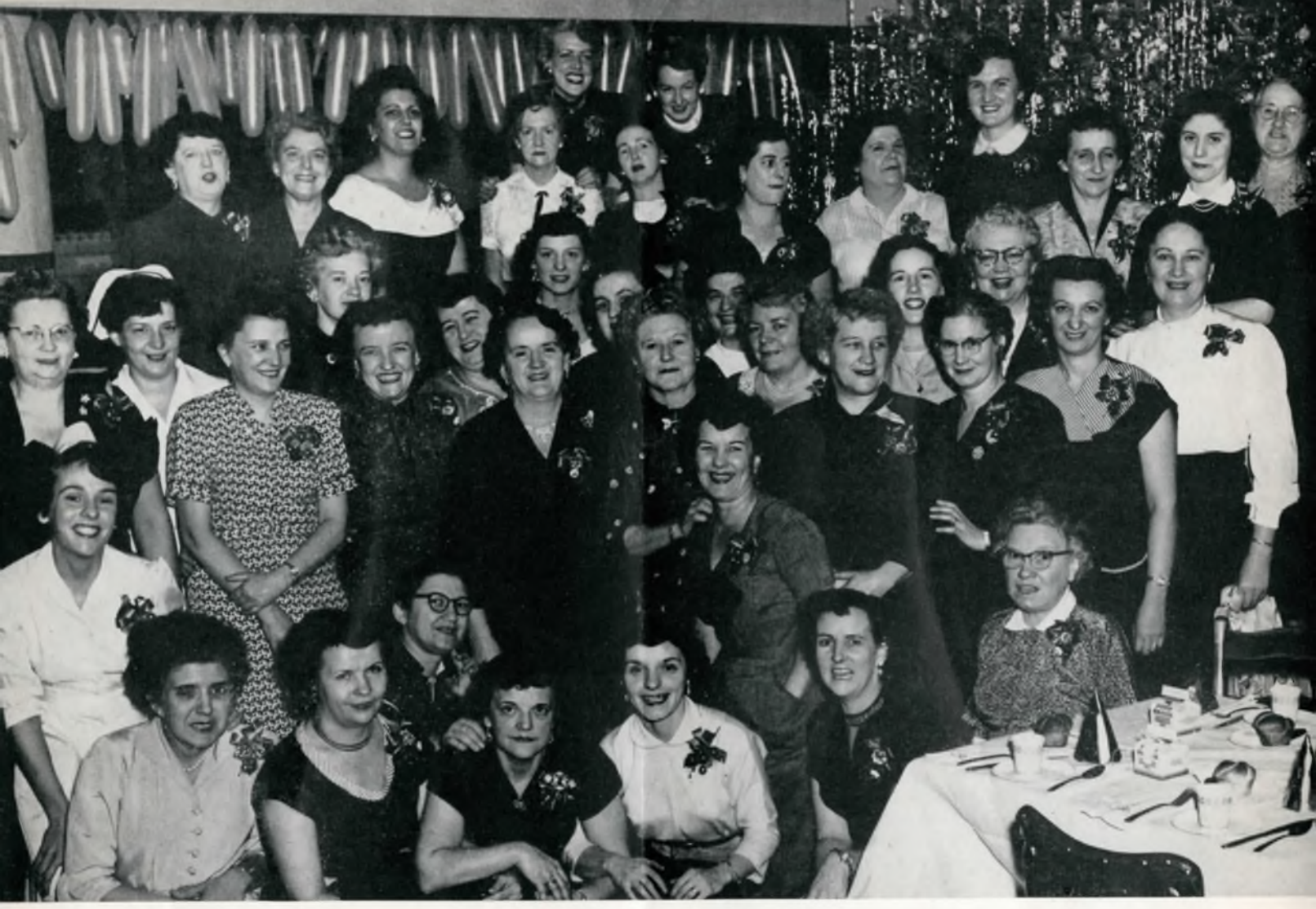
WOMEN'S COMMITTEE from Local 101, which served as hostesses for the fifth annual Christmas party staged by the union in Plant