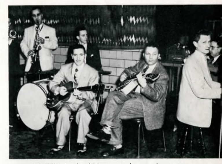
MUSIC IS SUPPLIED for the children's party by an orchestra composed of Philco employees.