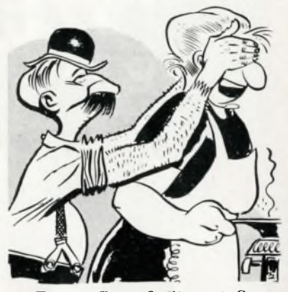
"Tyrone Power? Stewart Granger? Rory Calhoun??"

THE SMARTLY STYLED THREE-QUARTER-HORSEPOWER CONSOLETTE room air conditioner introduced for 1954 by Philco. This model is particularly adapted to apartments or homes with casement windows, since no part of the casement window structure has to be cut out in installation. The unit does not extend beyond the window line on the outside. It has a concealed control center on the top of the cabinet and the controls are of the rotary type and clearly identified for simple operation. Philco's Automatic Temperature Control that prevents overcooling of a room when the temperature drops is a feature of this model. This de luxe model is available in a one-horsepower model that has five 4-way adjustable grilles instead of the four 4-way grilles on Model 184K at left. The wave design of these adjustable grilles is finished in Arctic Dawn color that complements the grained mahogany wood cabinet of the unit.