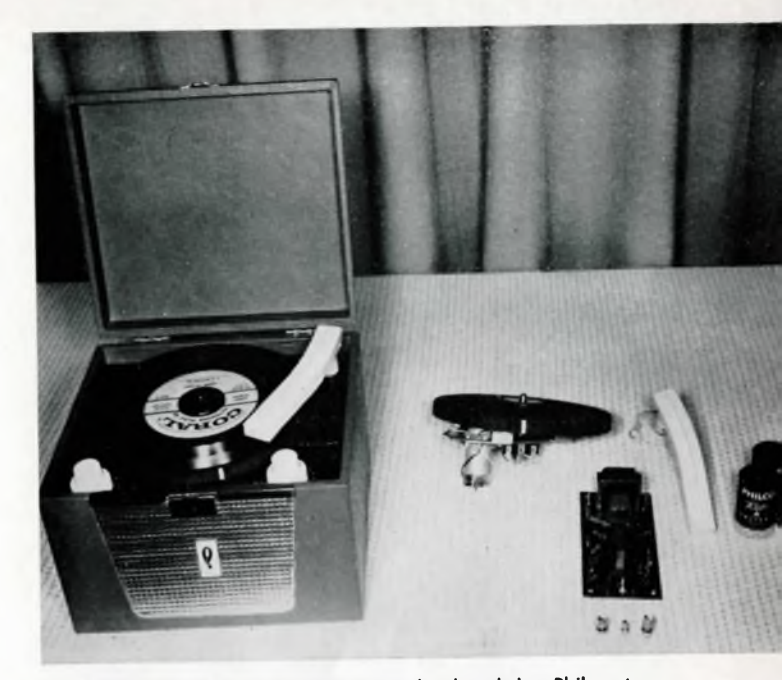
FIRST TRANSISTORIZED PHONOGRAPH developed by Philco, together with its components, emphasizes the simplicity and small size of the instrument. The "transistor" phonograph operates on four flashlight batteries without "plug-in" current. It will play 3,000 records without battery change. Three tiny transistors replace all vacuum tubes.

Philco color stylists have adapted 13 color "originals" from Latin America to the new radios. These colors have been arranged in complementary combinations to enhance the decorator scheme of any room.