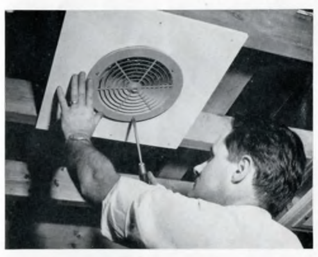
FINISHING THE INSTALLATION of the air supply outlet by screwing in the louvre grille. Five such outlets are provided in Philco's "do-it-yourself" central air-conditioning kit.