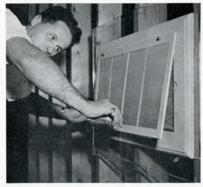
FINAL INSTALLATION of the return air grille used in Philco's "doit-yourself" kit. A permanent type aluminum filter is used. The filter requires only washing and spraying with an aerosol oil mist to renew its filter action.