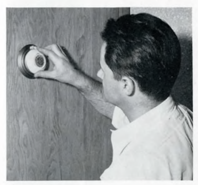
AUTOMATIC THERMOSTAT CONTROL can be placed at any point in the home and automatically keep the temperature at a preselected point. Air-conditioning units can also be operated on "fan" only with this control to ventilate home.