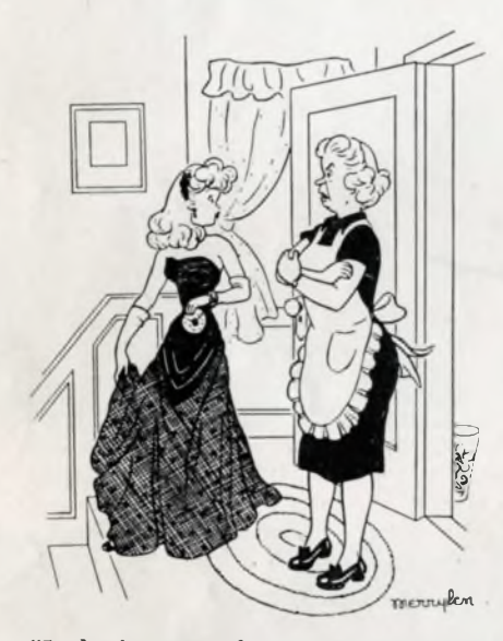
"I don't care if it is Leap Year. Don't propose to anybody till you find out if he's got a good job!"