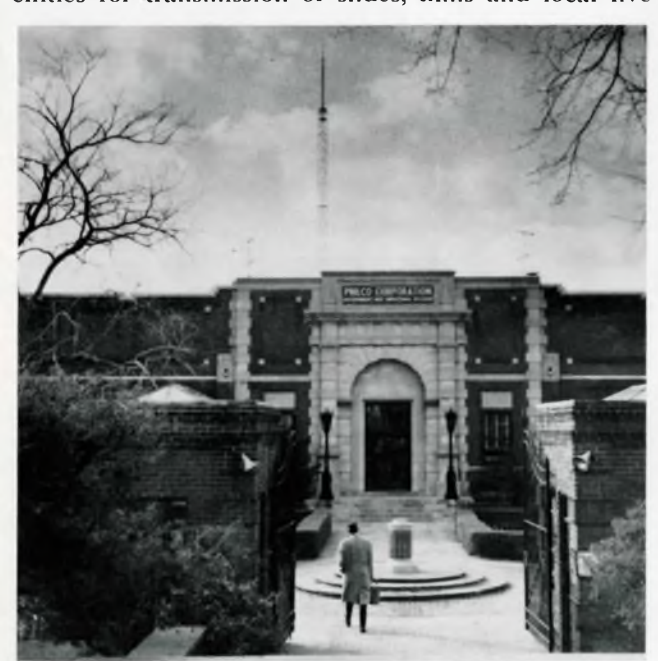
PHILADELPHIA'S LATEST TV BROADCASTING STATION—KG2XCV— is using this 150-foot antenna atop Philo's Government and Industrial Division Plant at 4700 Wissahickon Avenue. The Division is operating the experimental UHF station on Channel 23 for development of equipment.

A Philco low-power TV "package" includes a transmitter, monitoring equipment, high-gain antenna and transmission line, and local program originating facilities for transmission of slides, films and local live