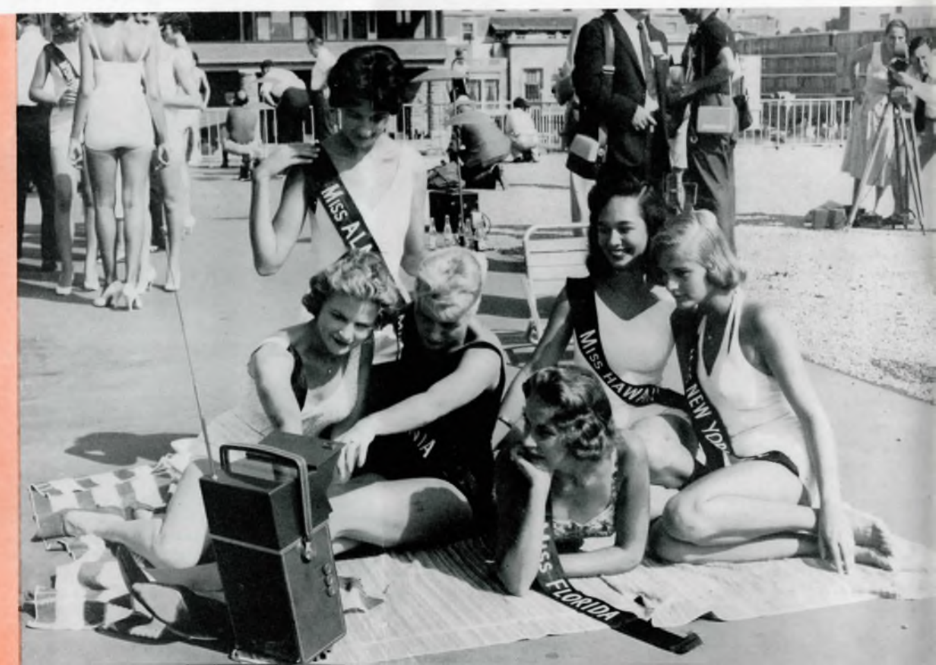
Philco's "Safari" TV created attention on a sun deck overlooking Atlantic City's boardwalk for these hopeful contestants who got their first view of the world's first battery operated, all-transistor, portable TV—made at Plant 10.