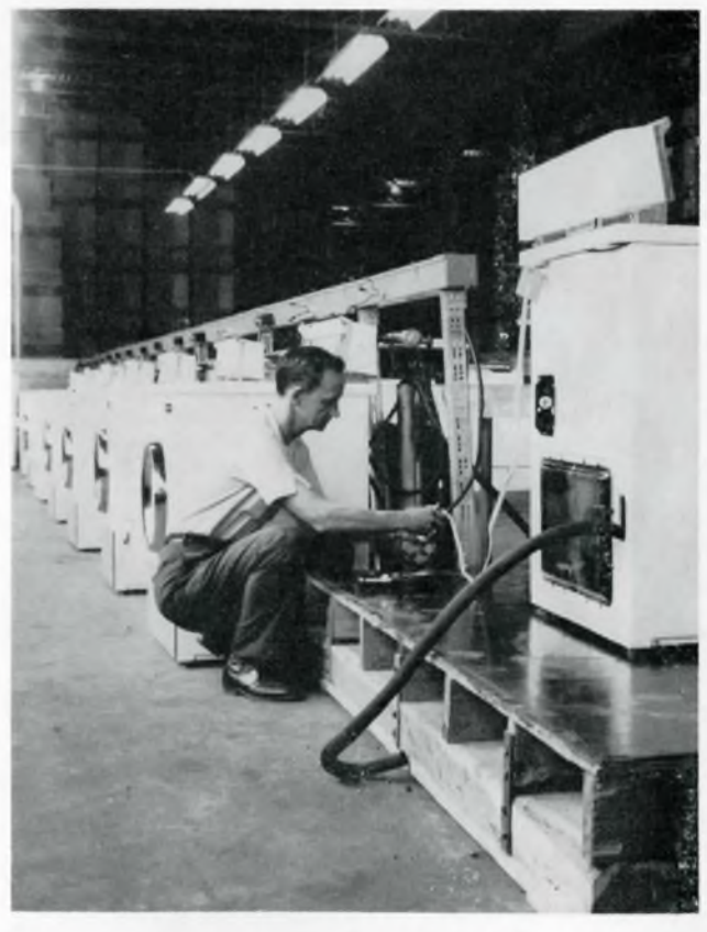
LIFE TEST installations are meant to duplicate those expected in homes. Washer mounted on section of conventional floor may reveal fault that would not show up if it were set on concrete.

Conditions for the performance life tests simulate normal in-home use, even to misuse and lack of proper (Continued to page 14)