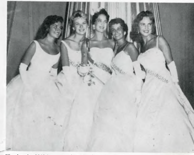
Miss America 1960 is congratulated by the runners-up—Miss Wisconsin, first; Miss Washington State, second; Miss California, third, and Miss Arizona, fourth.

Philco products were much in evidence for the thousands of visitors to the shore city for the Pageant. These products were shown in leading boardwalk hotels, the press bureau and other business places where they attracted highly favorable comment.