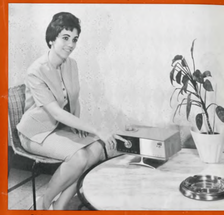
Philco's new portable negative ion generator which relieves distress caused by airborne allergies.

Distribution of the unit is being made through Smith, Kline & French Laboratories, Philadelphia, and McKesson & Robbins, Inc., New York, prominent wholesale drug distributors.