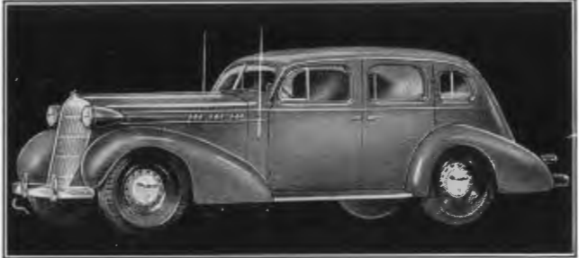
Showing two PHILCO Cowl Aerials installed. Engineering tests show that double the signal pickup may be obtained when two aerials are used. Appearance is greatly improved,