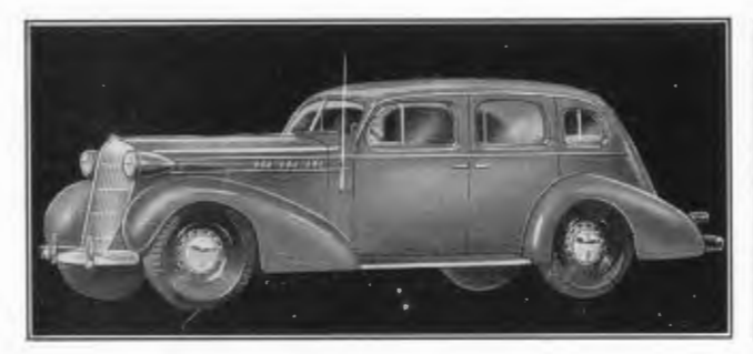
PHILCO Auto Radio Cowl Aerial, Part 45-2470

Quality, performance, appearance and price will enable PHILCO dealers and servicemen to get the lion's share of the auto radio aerial business.