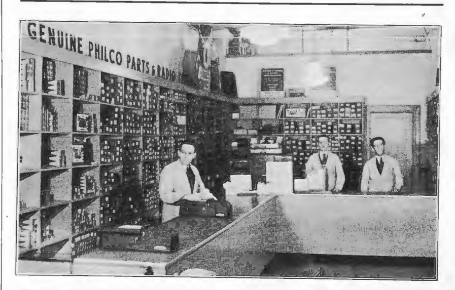
Parts Department, Columbia Wholesalers, PHILCO Distributors in Baltimore, Md.

There are many possibilities of this kind. If you are not now using the standard R. M. S. stationery or are not employing the R. M. S. insignia electro in your own stationery, you are missing a good bet. These electros can be obtained for as little as 30 cents from your PHILCO distributor, and they will certainly add to the prestige of your business stationery.