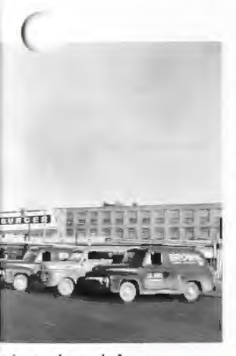
rvice trucks ready for service operations.

3. Very little or no planned advertising and merchandising programs of a consistent nature are being used by this group. Occasional newspaper ads paid 100 percent by themselves are run. Results usually do not warrant the expense because ads lack the professional punch that produces business. Dealer becomes convinced that ads are a waste of time and money, and forgets the whole idea.