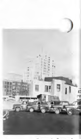
Brown's fleet of ser a busy day of big

Brown's Sales and S from service alone fo did when Brown offer