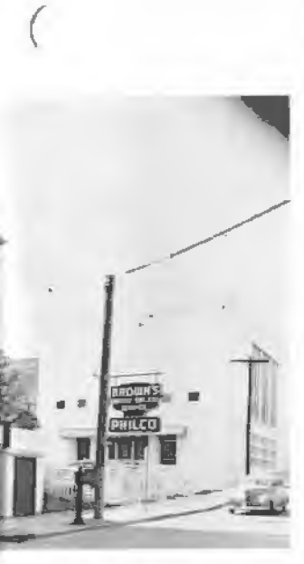
Service Center grosses our times more than it red service exclusively.