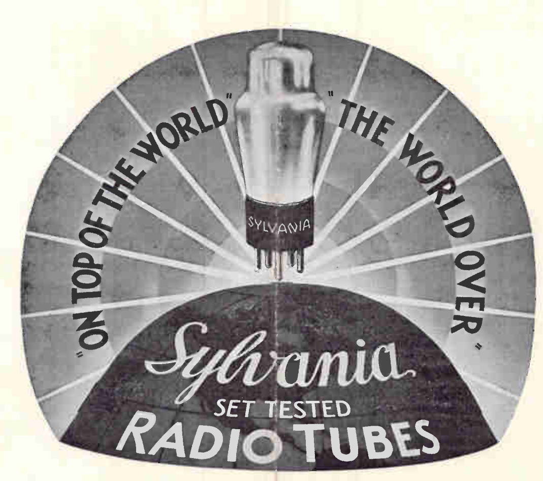
This Sylvania window display is not only strikingly effective—it is also truthful. Sylvania Tubes are sold all over the world, and new and strange-sounding names from the far corners of the earth are being added so fast that it is hard to keep up with them. The display is furnished free to dealers who will plan to use it profitably. The colors, deep blue, brilliant orange, and white, make it a grand attention-getter in the window, and afterward help to brighten dark corners inside the store. Order through your Sylvania jobber

The next point for consideration is the first detector and oscillator circuits. With the advent of electron-coupled pentagrid converter tubes a single tube suffices for detector-oscillator service. Often this is a decided advantage from the standpoint of cost and performance.