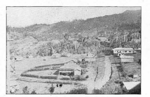
WAU, NEW GUINEA