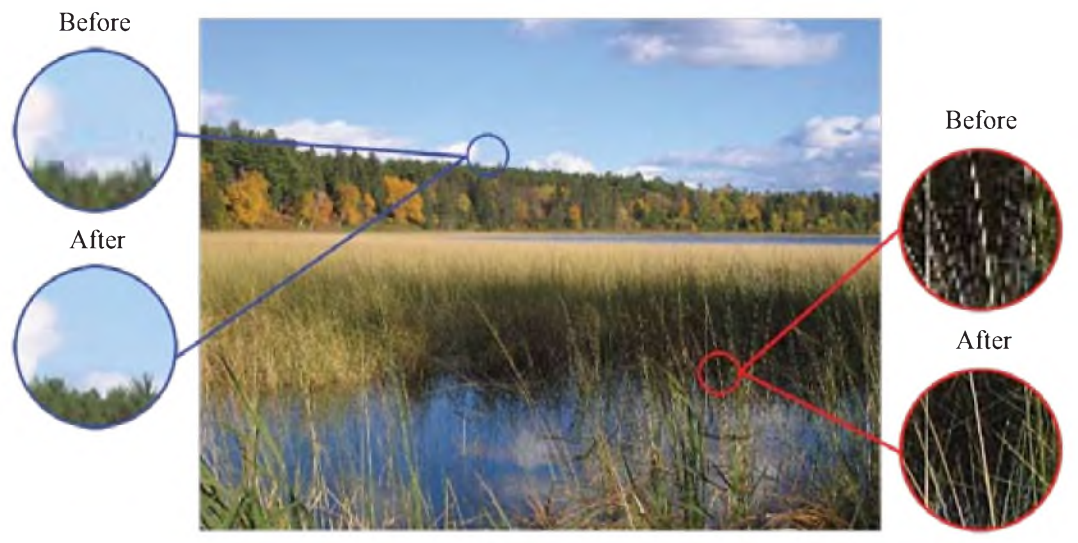
(Left) The Radiance's advanced Mosquito noise reduction cleans up the halo artifacts that lie on hard transitions, like the tree line to sky transition. (Right) The NoRing (tm) scaling and de-interlacing effects are obvious in sharp straight lines, such as the tall grass.

Payment on some packages are under $150.00