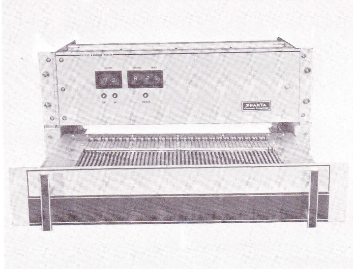
READY, WILLING AND ABLE! ... the access ease of the RS250 is clearly pictured in the photo at left (above). Selection switch "drawer" pulls out for programming changes, while the plug-in circuit boards are mounted vertically behind the full-width door. LED readouts remain attached to the circuit board edges; only the windows move in the door. Circuit boards have positive locks to prevent accidental movement. The drawer features simplified, foolproof locks for each stopping position and removal. Photo at right depicts the operator's view of the RS250 with drawer fully extended for program changes to be made. "Event", "Source" and "Tray" indicate the next commercial announcement cartridge which will be played when the Model 1052 Program Controller makes a "request" from the RS250.