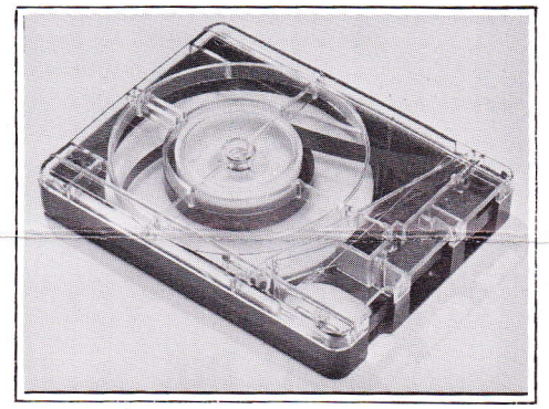
NEW ON THE SCENE...above, is the new Sparta Premium Tape Cartridge. Fewer parts, larger, all-purpose pressure pads, cue-locking tape brake and outstanding performance

The Sparta Premium Cartridge is marketed as the AudioPak A-2 and is