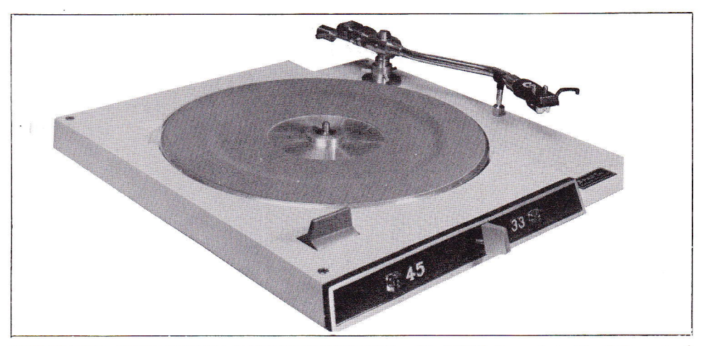
THE SPARTA GT12 CUSTOM 2-SPEED TURNTABLE, with ST220 Tone Arm. The full range of accessories for the GT12 purchaser include TEP-series pre-amplifiers, single, or dual, Showcase returns and the user's choice of popular pickup cartridges.