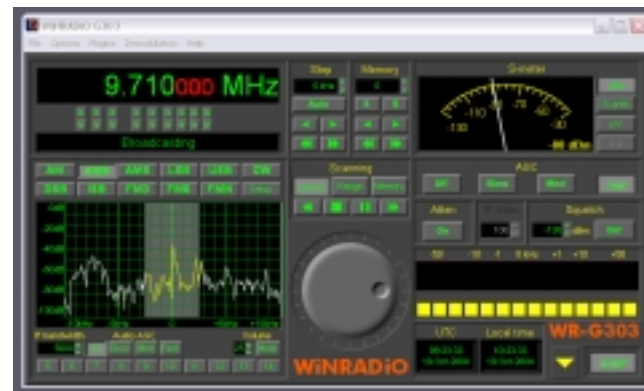
Figure 5: This is the G303 with its Professional Demodulator. As well as preset filters at bottom left, the IF Bandwidth box just above has a three-part control on its right that allows you to vary the filter width in 1 Hz steps. The yellow squares on the right are one of the G303's many tuning controls.

Winradio G303: Like the G305 and G313, the G303 can be bought either as a PCI card to plug inside the PC or as an external box that connects to the PC's USB port. Coverage goes from 9 kHz to 30 MHz. The hardware is available with two levels of software known as the Basic and Professional Demodulators. The Professional version is essential for any serious DXing so I'll concentrate on this. It provides AM, Sync AM, LSB, USB, DSB, ISB, CW and FM with optional DRM software that integrates neatly into the on-screen control panel. Bandwidth can be smoothly adjusted in 1 Hz steps up to a maximum of 15 kHz, alternatively there are ten presets for each mode.