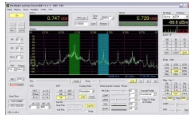
Figure 3: The SDR-1000 has an excellent spectrum analyser display and can simultaneously receive on two frequencies, as shown here. The mode and filter buttons are on the right, bandwidth can be adjusted using the sliders at lower right or by dragging the filter edges on the main display.

FlexRadio SDR-1000: This one's unusual in several significant respects. First, it's not a receiver, but an amateur transceiver. However, with the transmit function disabled you have a general-coverage receiver that tunes 11 kHz to 65 MHz. Second, the hardware design is more like a direct-conversion receiver than a normal superhet. It employs an unusual circuit called a Quadrature Sampling Detector (QSD) that gives excellent performance but demands a very high-spec computer soundcard. Just two models of professional soundcard are officially approved for the SDR-1000 and they'll add either £100 or £200 to the overall cost. Having got one of these cards, you'll need to spend some time periodically calibrating the signals that go to it. The hardware part of the SDR-1000 comes in a larger than average black metal box and connects to the PC via a parallel printer cable rather than USB.