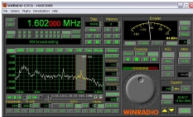
Figure 6: IF spectrum recording is a particularly good feature of the G313. Here, it's playing back a recording made at 1385 kHz. This allows two channels – 1380 and 1390 – to be re-received at 5 kHz above and below the center. The frequency display doesn't reflect the recorded frequency so you'd have to adjust it manually if it's confusing.

The most obvious difference, however, is the fully interactive spectrum display. Using the mouse, you can drag the filter edges where you want them or offset the whole passband. Similarly, the notch filter can be moved about with the mouse to take out any carrier or other source of interference. For rapid adjustment when working in a crowded band, this is absolutely superb stuff. One improvement that would help would be if the display could be averaged over time in the way that the SDR-1000's can, in order to reveal carriers better.