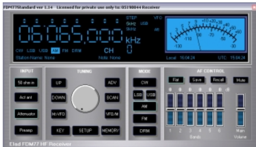
Figure 1: In Basic mode, the FDM-77 presents a control panel that resembles a typical hardware receiver. But note the audio graphic equalizer on the right.

Elad FDM77: This receiver comes in a small aluminum case that connects to your PC by USB. Coverage is 50 kHz to 60 MHz and it provides AM, LSB, USB, CW, FM and DRM modes. The receiver can be used at either of two levels – Basic, which allows only a fixed bandwidth and AGC setting for each mode, or Advanced, which lets you select 19 bandwidths for the IF filter and three AGC speeds.