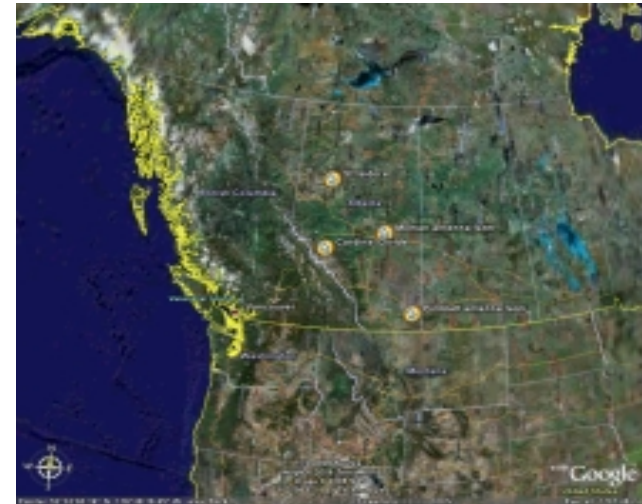
Receiving locations in Alberta

For most international MW DXing in Alberta, the beverage has been the antenna of choice. In my own case, living on the prairie, antenna supports of any height are hard to come by, so I have used beverages extensively, and with good success. Prior to having the land to run beverages I had to improvise with temporary antennas, and logged a number of DU stations by connecting my receiver to an east/west barbed wire fence with a couple of insulators cut into it. Another year I ran a short (400') beverage across a dugout, and it received Japan quite well, in spite of the fact that temperature fluctuations resulted in it becoming a BFI antenna (Beverage Frozen in Ice – how's that for a new acronym!) for the last half of the winter. In recent years I have also used a K9AY with some success, though the nulling capability in this part of Alberta is rather variable. The K9AY is dependent on a good ground, and the soil around here is sandy, and usually dry. We have used the same K9AY at Don Moman's location NE of Edmonton, where the ground is better, and the antenna performance seemed to be superior there, often pretty much equaling the beverages. I intend to do some experimentation with a ground-independent antenna, such as the flag, but haven't done so yet. Mike Stonebridge has used a EWE with good success in St. Isidore, though I suspect it wouldn't be as successful in my area due to the inferior ground.