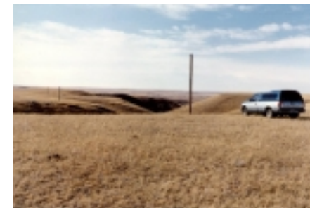
Alaskan beverage at Pimblett antenna farm

As mentioned earlier, my own listening site is located in southeastern Alberta, about 70 miles north of the border with Montana, and about 40 miles west of the border with Saskatchewan. As the crow flies, it is about 1000 km (or a little over 600 miles) from the Pacific coast. As expected, I don't hear the quantity or quality of DU/TP signals heard by DXers on the coast, but with a good antenna it is still possible to hear a good number of stations when propagation allows. I currently have 7 beverage antennas in various directions, including one at 315 degrees for TP reception, one at 40 degrees for TA reception, and others at 240 and 270 which work well for DU reception. They all have lengths in the range of 1000' to 1200'. They're about 8 feet off the ground, which is bit higher than would be ideal, but any lower and they fall victim to the area wildlife.