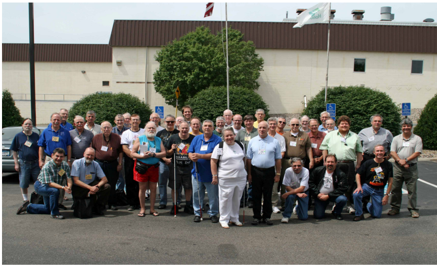
Minneapolis, Minnesota 2013! August 1st thru 4th 2013 2013 Convention Report

The 2013 DX Convention was singular in several respects. First, NRC, IRCA, MN DX Club and WTFDA members came together in a historic confluence of talent and diversity. Second, we decided to take the best ideas of the clubs' previous conventions... and then move beyond those traditions to create a " Learning and Sharing " experience. Finally, as a major recurring agenda item, we promoted and encouraged an undercurrent of discussion on the future of our clubs. http://www.durenberger.com/documents/Program.pdf .