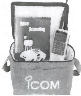
Go Bag and book are also sold suparately.

The Icom IC-RX7-05 is a slim and smart wideband receiver that tunes from 150 kHz to 1300 MHz (less cellular and gaps) in these modes: AM. FM Narrow and FM wide, It features a large, backlit LCD plus a nice keypad. It is splash resistant to equivalent IPX4 standard, CTCSS and DTSC decode is built in. Other features include: keypad, RF Gain, Attenuator, Auto Power save and voice squelch con-