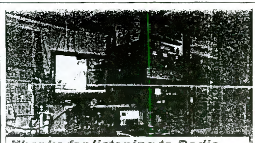
Thanks for listening to Radio Whatever! Pennsvivania-USA 6925 AM, 100 watts of unadulterated power!

CHINA, PEOPLES REPUBLIC OF: China Radio International 7350 via Kashi The station verified my report in 12 ds. // a f/d "China's Endangered Rare Animals - Phayre,s Leaf Monkey" cd.. They also sent three different station stickers and a promotional pamphlet about CRI's English