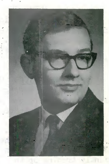
11 11 3