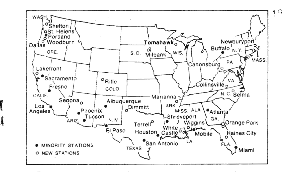
35 communities are prime candidates for new stations

While generally ignored in the public debate — which focused in large part on the fears of "Grand Ole Opry" fans who were afraid they would be unable to tune in Nashville station WSM — the main spur be-