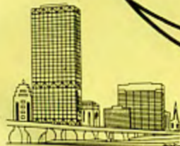
Sponsored by: National Radio Club